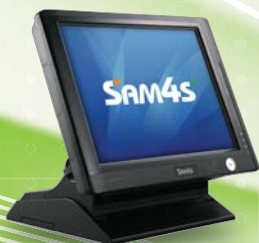
SPT-3700 TOUCH SCREEN