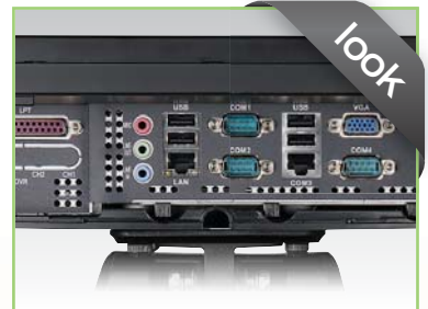
• Main Comms Ports located at the bottom of the screen.