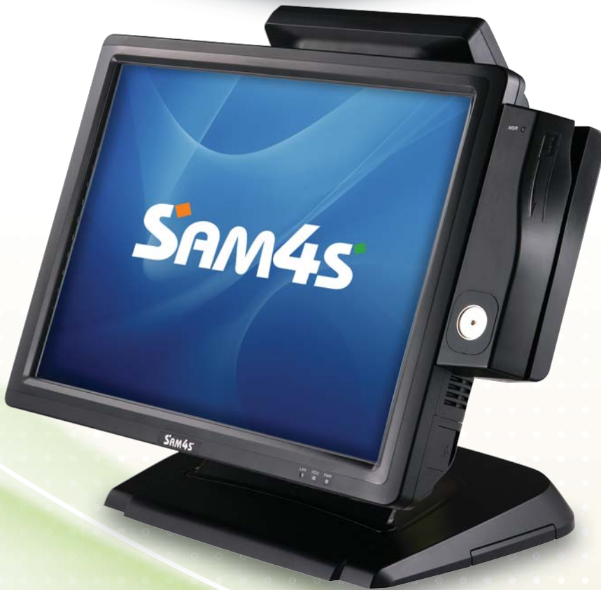
• Shown with Optional 7" LCD Rear Display.