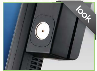
• Dallas Key/MSR Sign On.