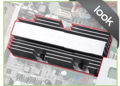
• Clean, Quiet Fan Free Design.