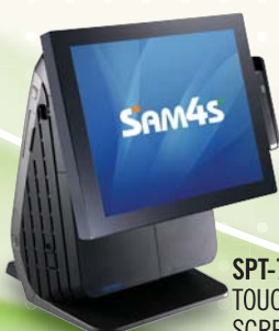
SPT-7500 TOUCH SCREEN