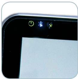
Integrated WiFi & Bluetooth

The OT-100 is a revolutionary new product specifically designed for the hospitality market, with its cutting edge styling this small and discreet unit is a fantastic mobile ordering terminal. Boasting a 4.3" touch enabled LCD (and 4 way directional sensor) the OT-100 is able to communicate using Wireless LAN and Bluetooth. With a drop resistancy of 1.2m and IP54 rating it is also very rugged.