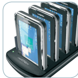
Optional Docking Station